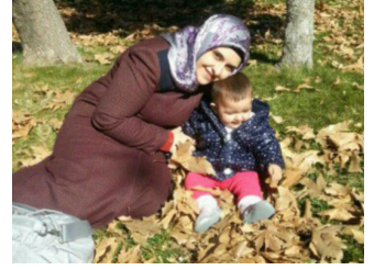
WOMAN IN FOURTH MONTH OF PREGNANCY DETAINED OVER GÜLEN LINKS