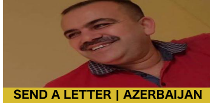
SEND A LETTER | AZERBAIJAN