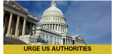
URGE US AUTHORITIES

SERIOUSLY ILL EDUCATOR STILL HELD IN MANISA PRISON FOR 22 MONTHS