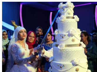
GROOM DETAINED FOR 'INSULTING' ERDOĞAN, BRIDE PERFORMS CEREMONY ALONE