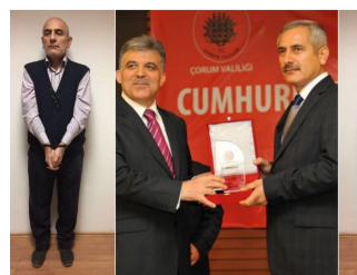
BUSINESSMAN FORCIBLY RETURNED FROM SUDAN TO TURKEY GETS 10- YEAR JAIL SENTENCE