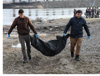
BODIES OF PREGNANT WOMAN, YOUNG GIRL FOUND IN EVROS RIVER