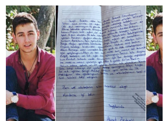
CONSCRIPT IN 5TH DAY OF MILITARY SERVICE GETS 14 LIFE SENTENCES ON COUP CHARGES