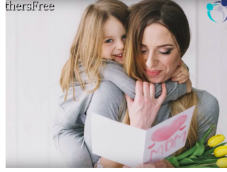
MOTHER'S DAY 2018: #SETMOTHERSFREE