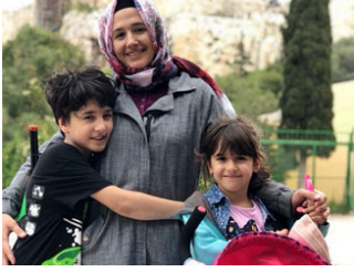
GÜLEN MOVEMENT-LINKED TURKISH WOMAN DIES IN GREECE AS SHE WAITS TO JOIN HUSBAND IN GERMANY