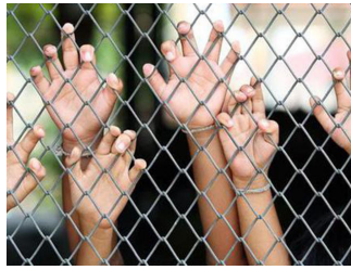
HUNDREDS OF YOUNG TURKISH CHILDREN JAILED ALONGSIDE THEIR MOMS