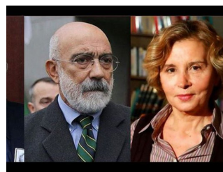
TURKEY SENTENCES JOURNALISTS TO LIFE IN JAIL OVER COUP ATTEMPT