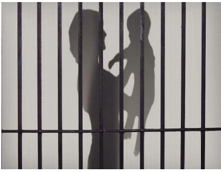
80 WOMEN REPORTEDLY SUBJECTED TO INHUMANE TREATMENT AT MERSIN POLICE STATION