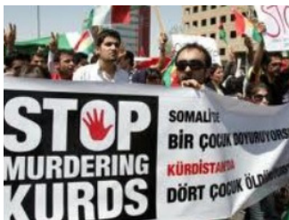
ARTISTS PUT IN PRETRIAL DETENTION OVER SONGS IN KURDISH LANGUAGE