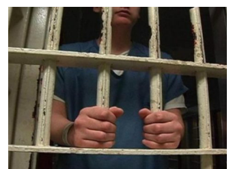
845 PEOPLE DETAINED OVER CRITICAL STANCE ON AFRIN OFFENSIVE