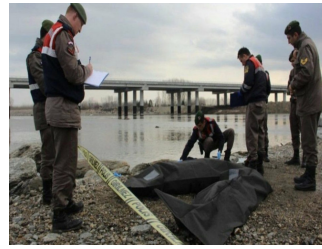
3 VICTIMS OF ERDOĞAN'S PERSECUTION DROWNED TRYING TO CROSS RIVER TO GREECE